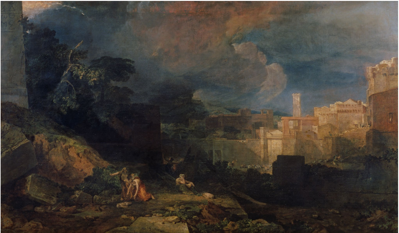
The Tenth Plague of Egypt, exhibited 1802; Joseph Mallord William Turner 1775-1851; Tate, Accepted by the nation as part of the Turner Bequest 1856